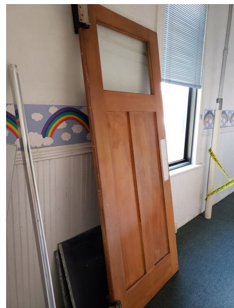
Door for sale - BEST OFFER 87-3/4" tall x 35-5/8" wide Sale will benefit renovation of former CAPS building.