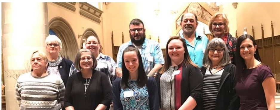
5 of our RCIA participants celebrated the Rite of Election this past weekend. They are pictured at Blessed Sacrament Cathedral with their sponsors.