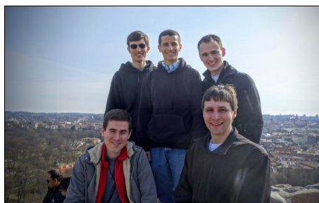
My friends and I, now all priests

Our original plans were to go to Georgia (the country, not the state) and Armenia. When the travel turned out to be too expensive and Mass availability seemed unreliable, we altered our plans and went to Lithuania and Latvia instead. (Most people went to places like England, France, or Germany. I had weird friends.)