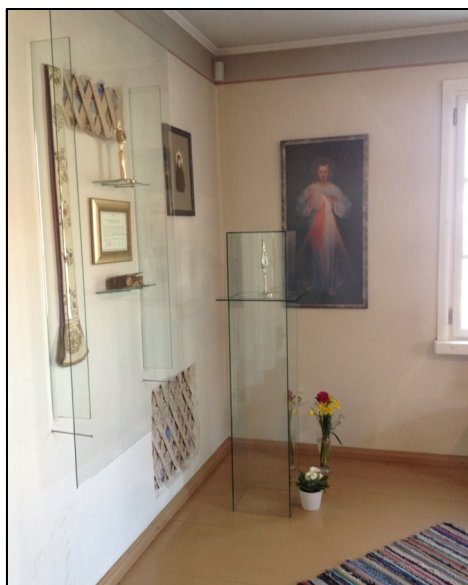
St. Faustina's entire "bedroom" was this corner

deserted. Upon entering we discovered that we were the only people there except for a curator who also tended the small gift shop. We turned a corner and entered a simple room. This room was also small and plain, having been a shared bedroom for the sisters who lived there. Each sister only had a small corner of the room for their simple belongings. It was an image of poverty and extreme simplicity. It was in this small, plain, and insignificant corner of the world that Jesus conversed with St. Faustina Kowalska, appearing as the now-famous Divine Mercy image.